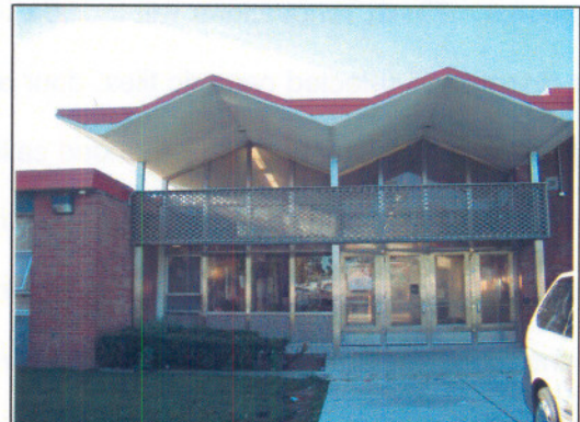
Pelham School - Main Entrance