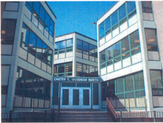
Woodson School - North Entrance

Currently, the Woodson School project is in the bidding phase. This facility, which consists of two schools - Woodson North and Woodson South - has a combined area of 160,000 square feet. The twin buildings, which are linked to a shared gymnasium / multi-purpose facility, were built in 1965. The site is bounded by Evans Avenue on the East, 44 th Street to the North, 45 th Street on the South and St. Lawrence Street on the West. Woodson North School is currently occupied and serves 516 students from 5 th to 8 th grade. Woodson South, which