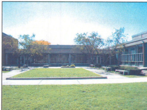
Murphy School - Entrance Court

Owen Academy, Murphy Elementary, Coffey Elementary, and McKenny Elementary schools comprise this upgrade project which began in July, 2006. The scope of the project consists of general upgrading of all four school facilities, including providing new play lots, repairing building envelopes and flooring, as well as upgrading the kindergarten restrooms. McKenny Elementary School IT will be upgraded, while Coffey Elementary School will receive a new wireless installation. This project is on track for completion at the end of June, 2007.