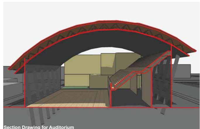
Section Drawing for Auditorium

The Dove Community Center project was envisioned as a means of responding to the educational and recreational needs of the lower Southeast Waukegan community, as well as those of the membership of the Sign of the Dove Church. Sign of the Dove, the owner and TAEI's client for the project, has been an anchor in this community and has served the spiritual needs of its congregation for 19 years. The main functions constituting this 30,000 s.f. project are: an auditorium/gym which will also serve as a nave; an education component with classrooms serving 1st through 6th grade with supporting elements such as offices, library and lunchroom; an administration segment which includes reception, pastors' offices, and a community center office and board room. This project also contains a performing arts element which consists of a demountable stage, a grand rehearsal room and an audio visual room. It also has a retreat garden consisting of a terrace and a meditative area. Support functions such as kitchen, storage area, and elevator and mechanical room complete the scope of this important endeavor. We look forward to reporting on the progress of the Dove Community Center in future TAEI newsletters.