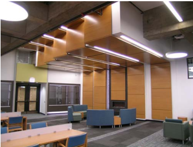
Informal Reading Area at Fireplace