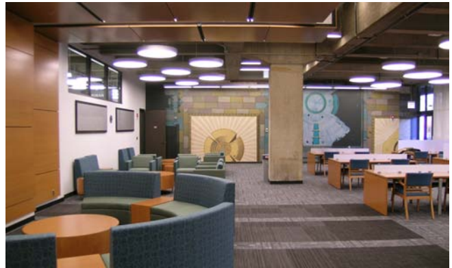
Reading Room, Looking North

The reconfigured UIC Daley Circle Library Reading Room was completed and reopened in early 2015. The Client has shared with TAEI that students and faculty alike are pleased to frequent this newly renovated space which includes a lounge area around an electronic fireplace for informal reading, a second informal reading area, and a third formal reading area for quiet study.