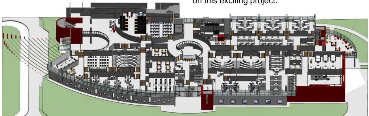
Second Floor Plan Perspective

The T A E L Team completed the Schematic Design Phase for the design of the new 130,000 s.f. Allied Health Facility for South Suburban College (SSC). The entire package was very well received by SSC, and the formal submission to Capital Development Board (CDB) more than satisfied the criteria set for the Schematic Design Phase. Prior to starting Design Development, the project was put on hold by the Governor's Office of Management and Budget, pending approval of a full State budget. T A E L looks forward to a budget resolution so that we could resume work on this exciting project.