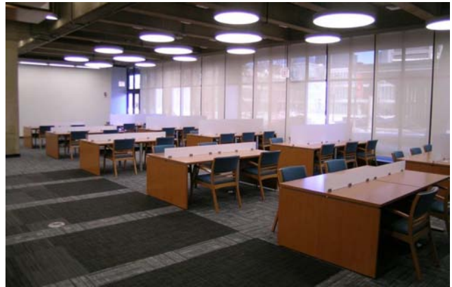
Formal Reading Area